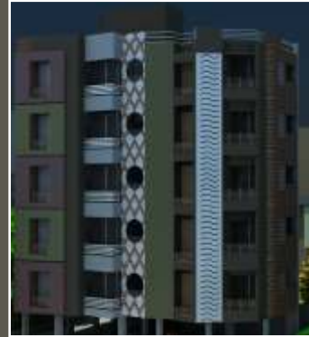
Madhupuri Apartment Vishvakunj Cross Road