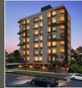
Ankur Apartment Anjali Cross Road