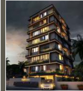
Madhupuri Radiance Mahalaxmi 5 Rasta