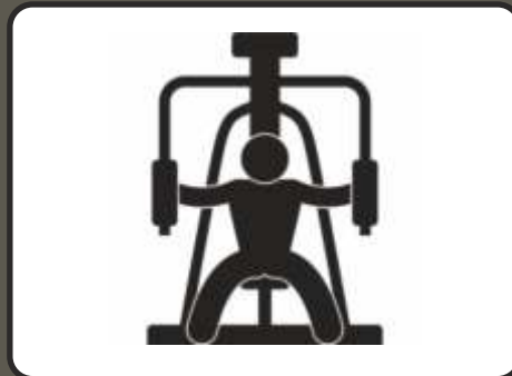
Well-equipped Gym in basement