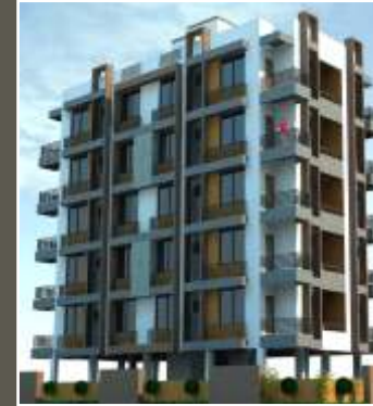
Nateshwar Apartment Paldi