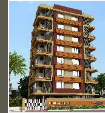
Nilesh Apartment Chandranagar