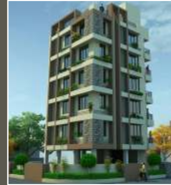
Madhupuri Residency Bhattha